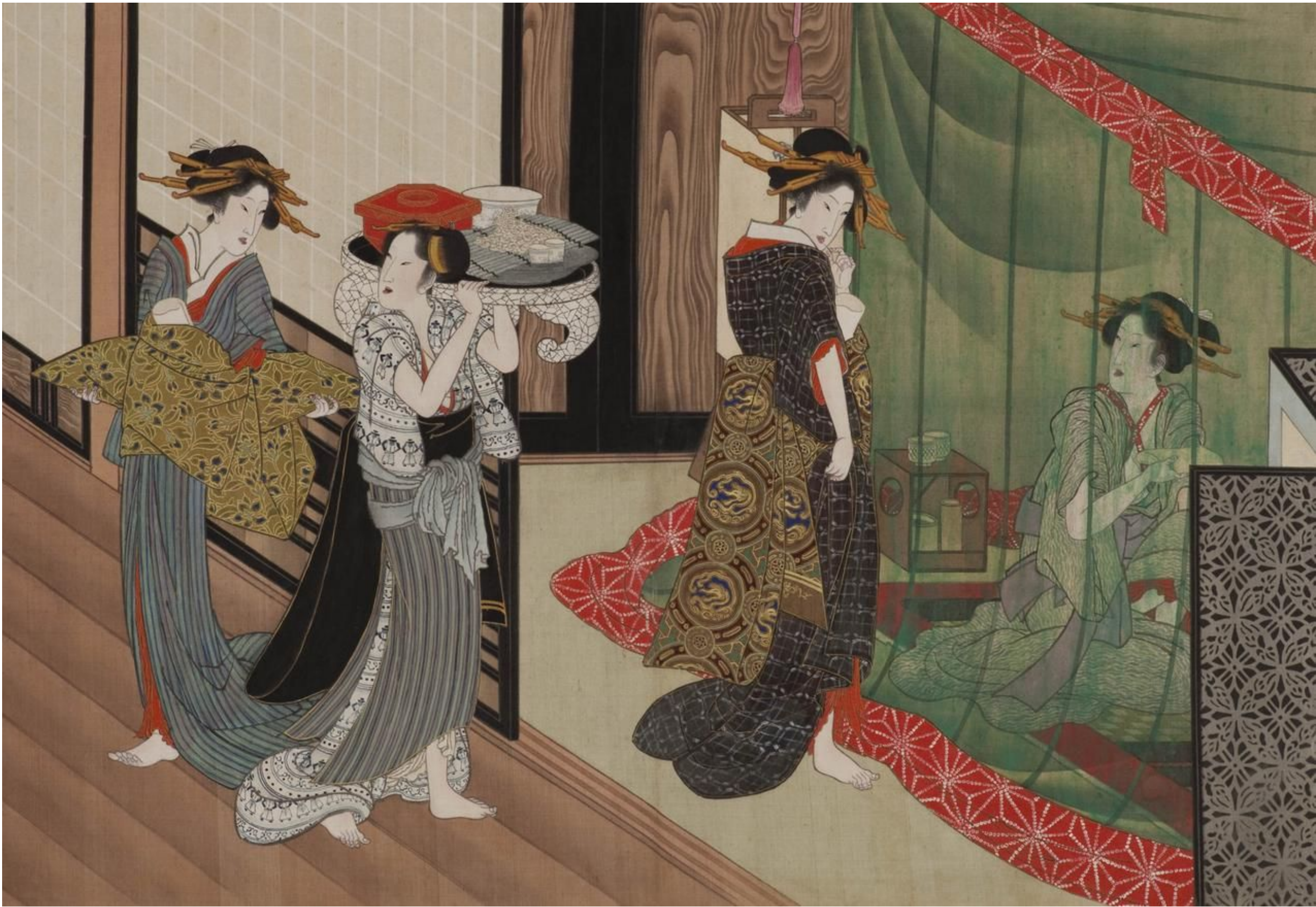
Utagawa Toyokuni. A painting from 'One Hundred Looks of Various Women (1816)