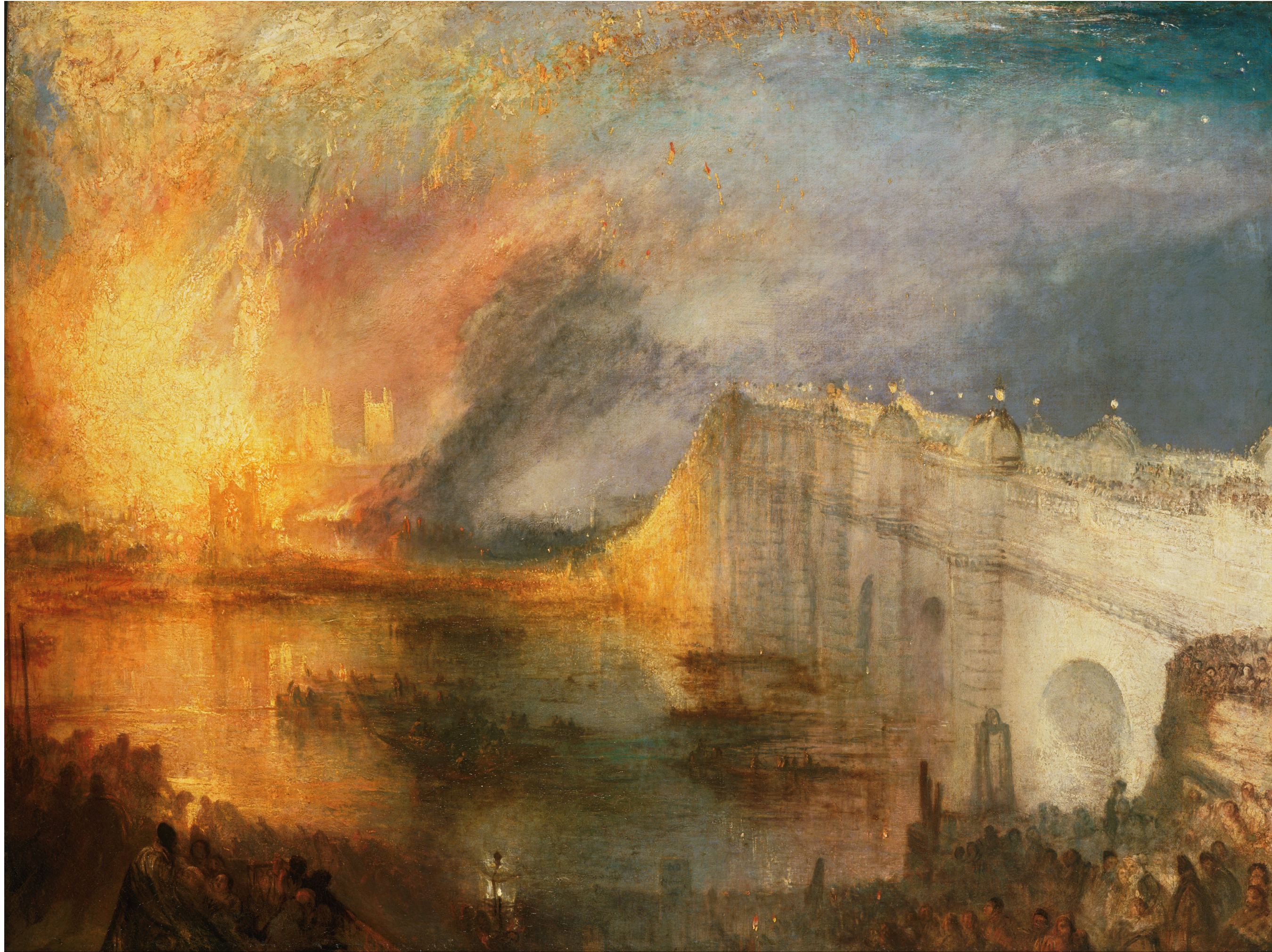
The Burning of the Houses of Lords and Commons, J. M. W. Turner (1834)