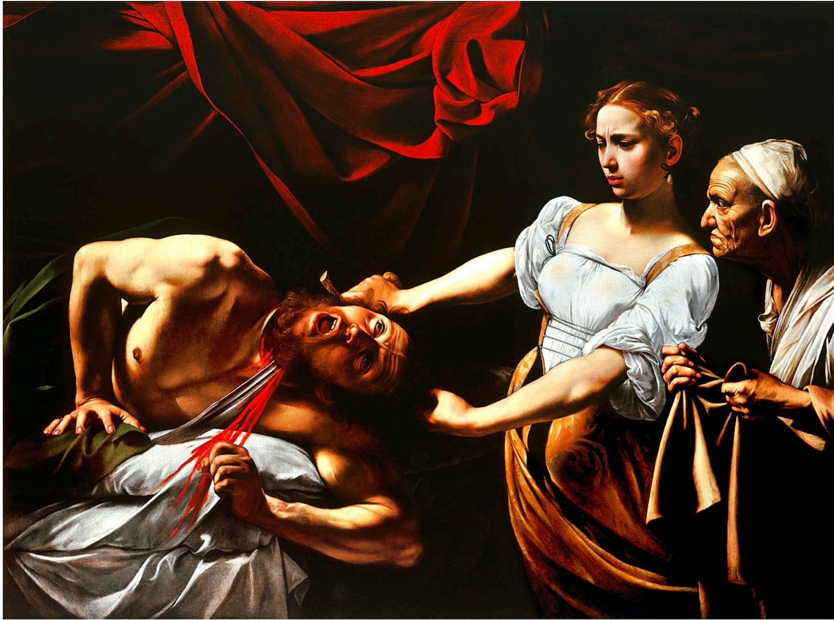
Judith Beheading Holofernes , Carravaggio (c.1598–1599 or 1602)