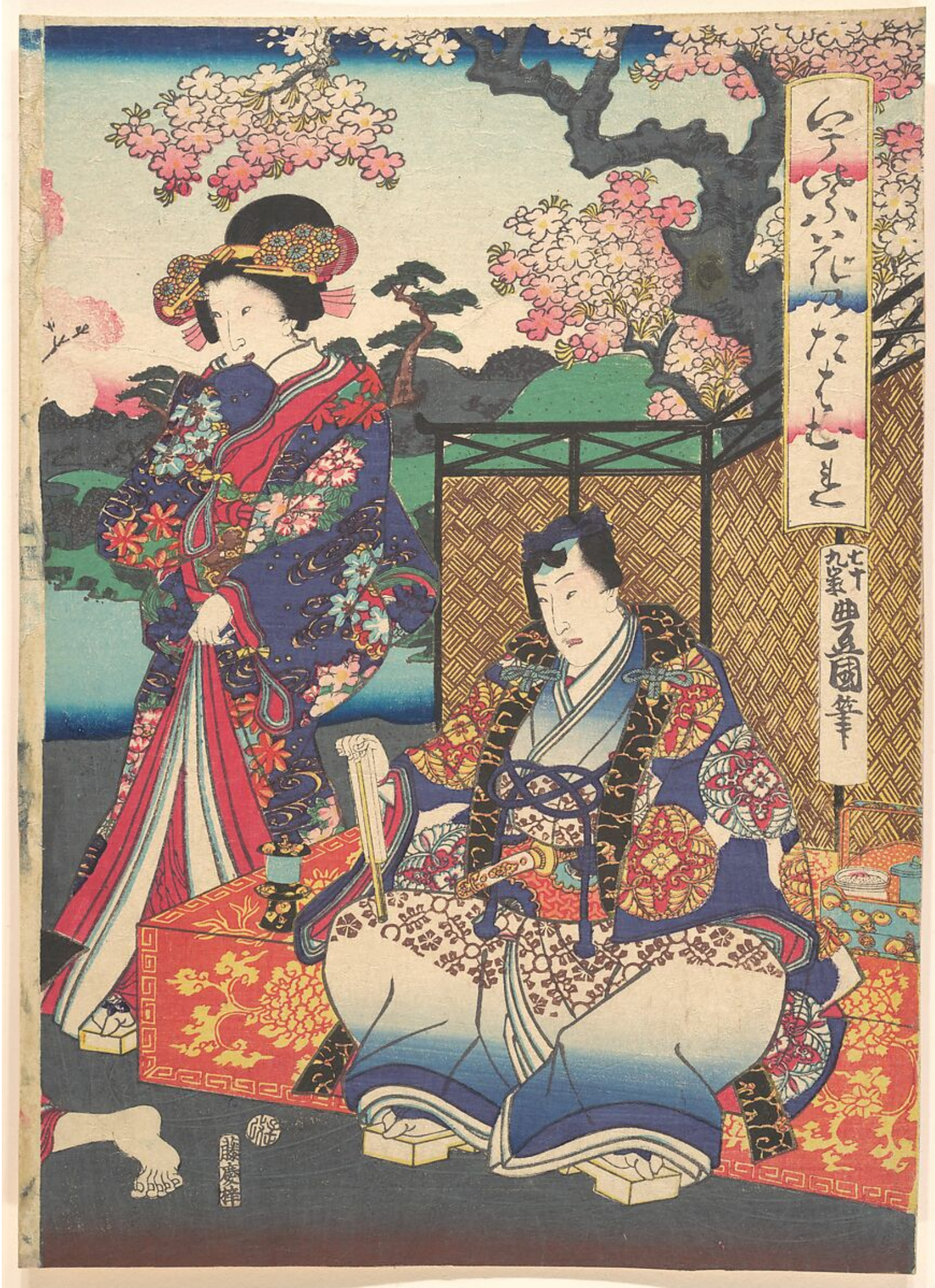
Utagawa Kunisada | Japanese Edo period (1615–1868)