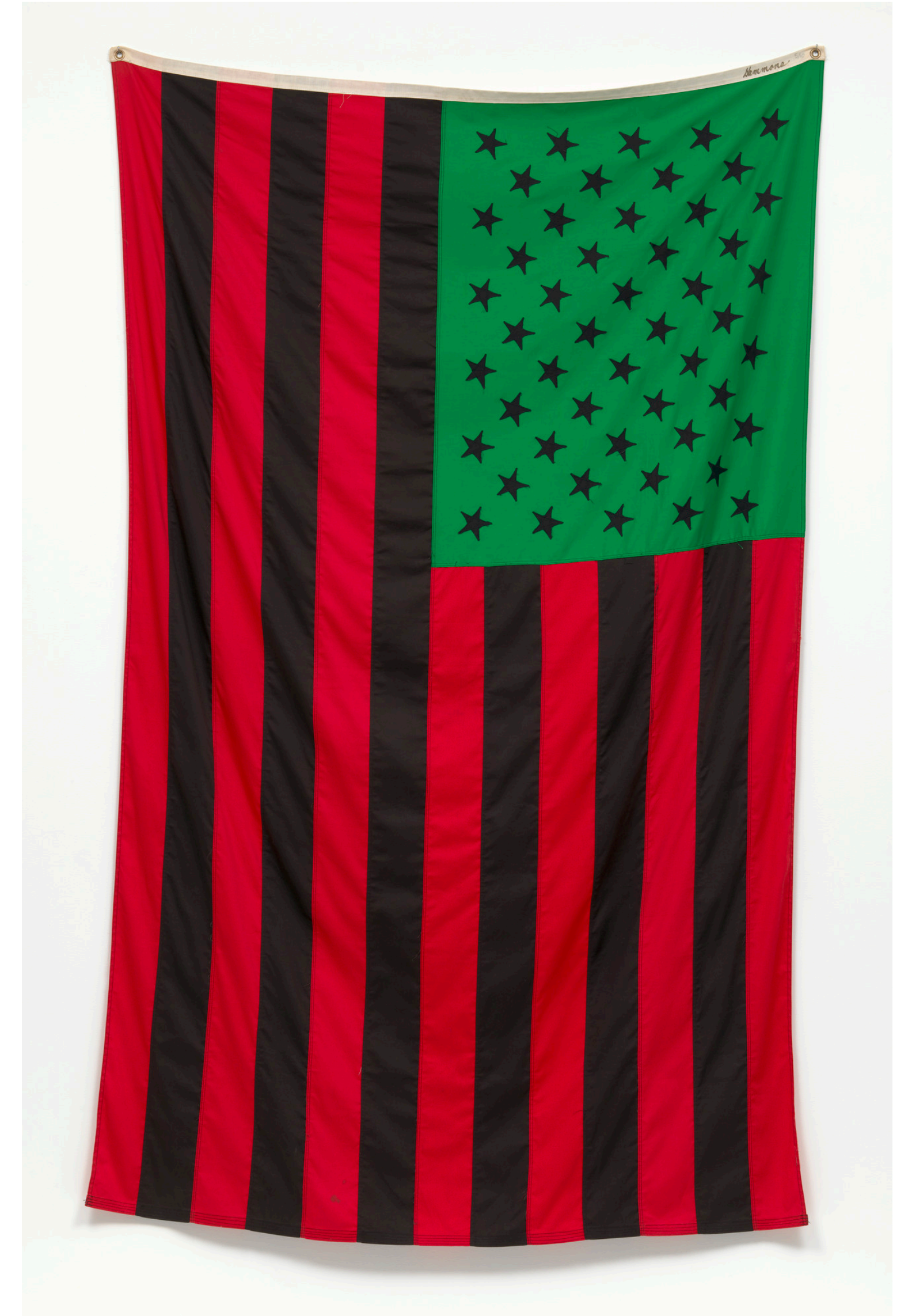
Untitled (African-American Flag), David Hammons (1990)