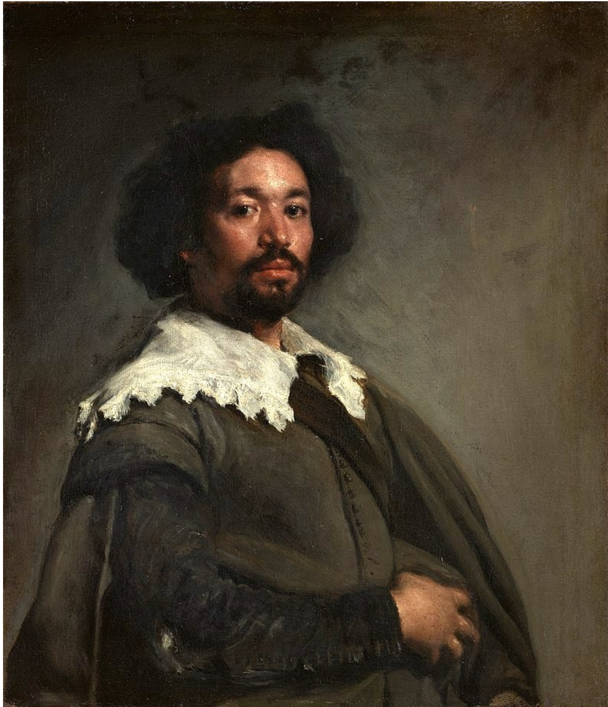
Retrato de Juan Pareja , Diego Velázquez (1650)