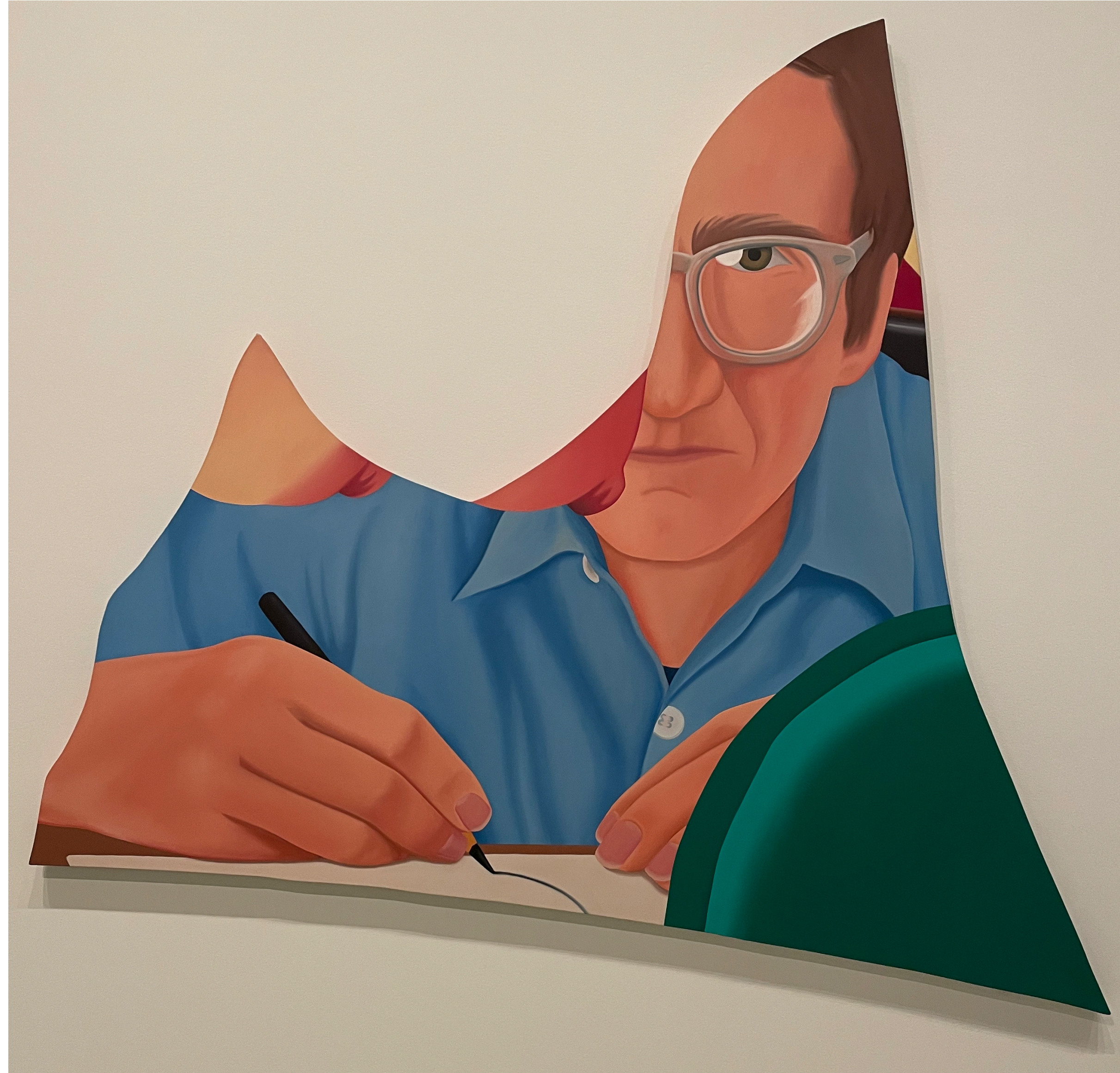
Wesselmann. Self Portrait While Drawing , 1983 | Oil on shaped canvas 188x221 cm