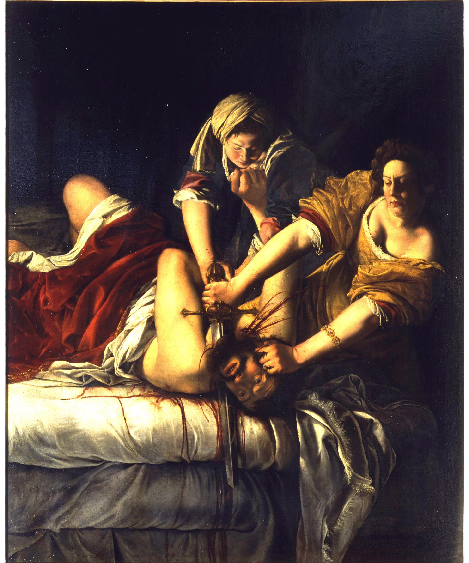
Judith Slaying Holofernes , Artemisia Gentileschi (c. 1620)