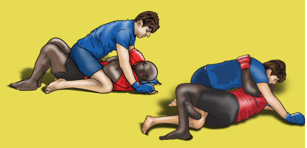
39.MOUNT DEFENCE INTO HALF-GUARD DEFENCE