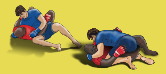
38.KESA CONTROL DEFENCE INTO HALF-GUARD DEFENCE