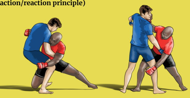
15. SINGLE LEG