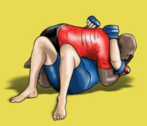
33.BUTTERFLY GUARD SWEEP INTO SIDE CONTROL