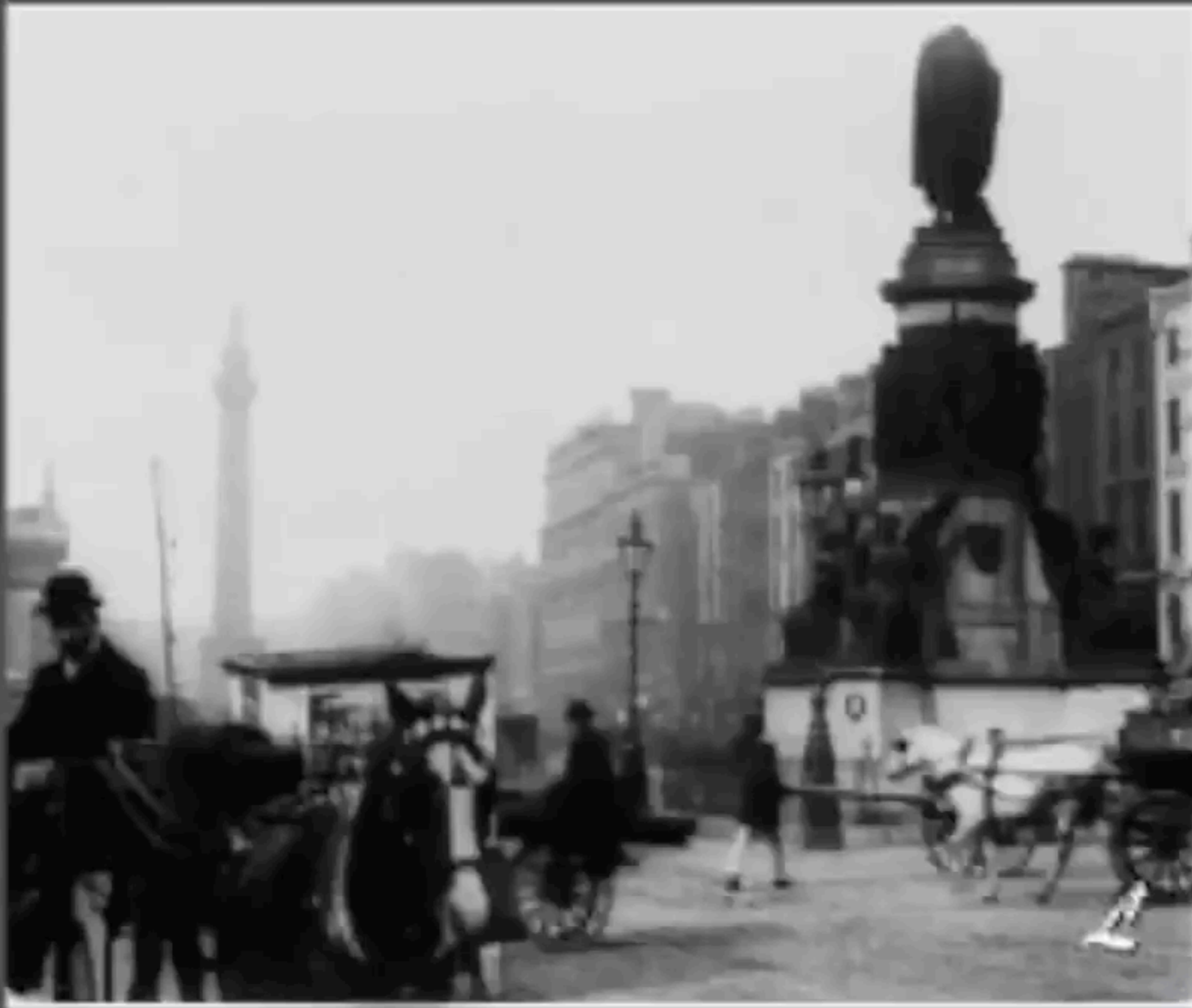
Frères Lumière, O'Connell Street, 1897