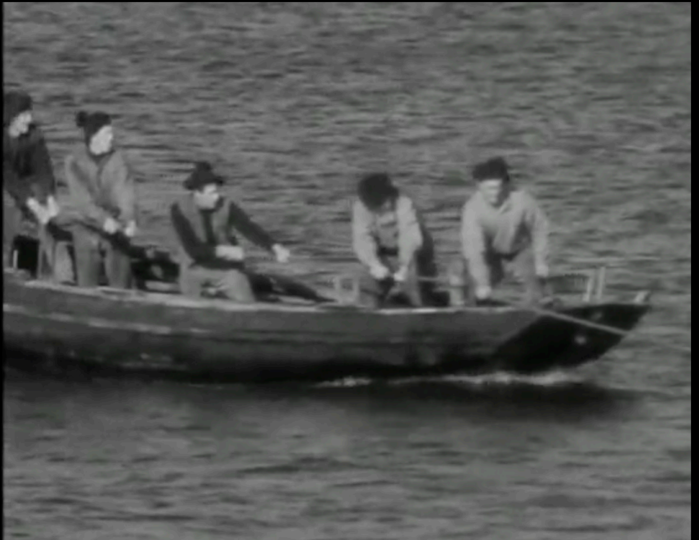
Robert FLAHERTY, L'Homme d'Aran , 1934