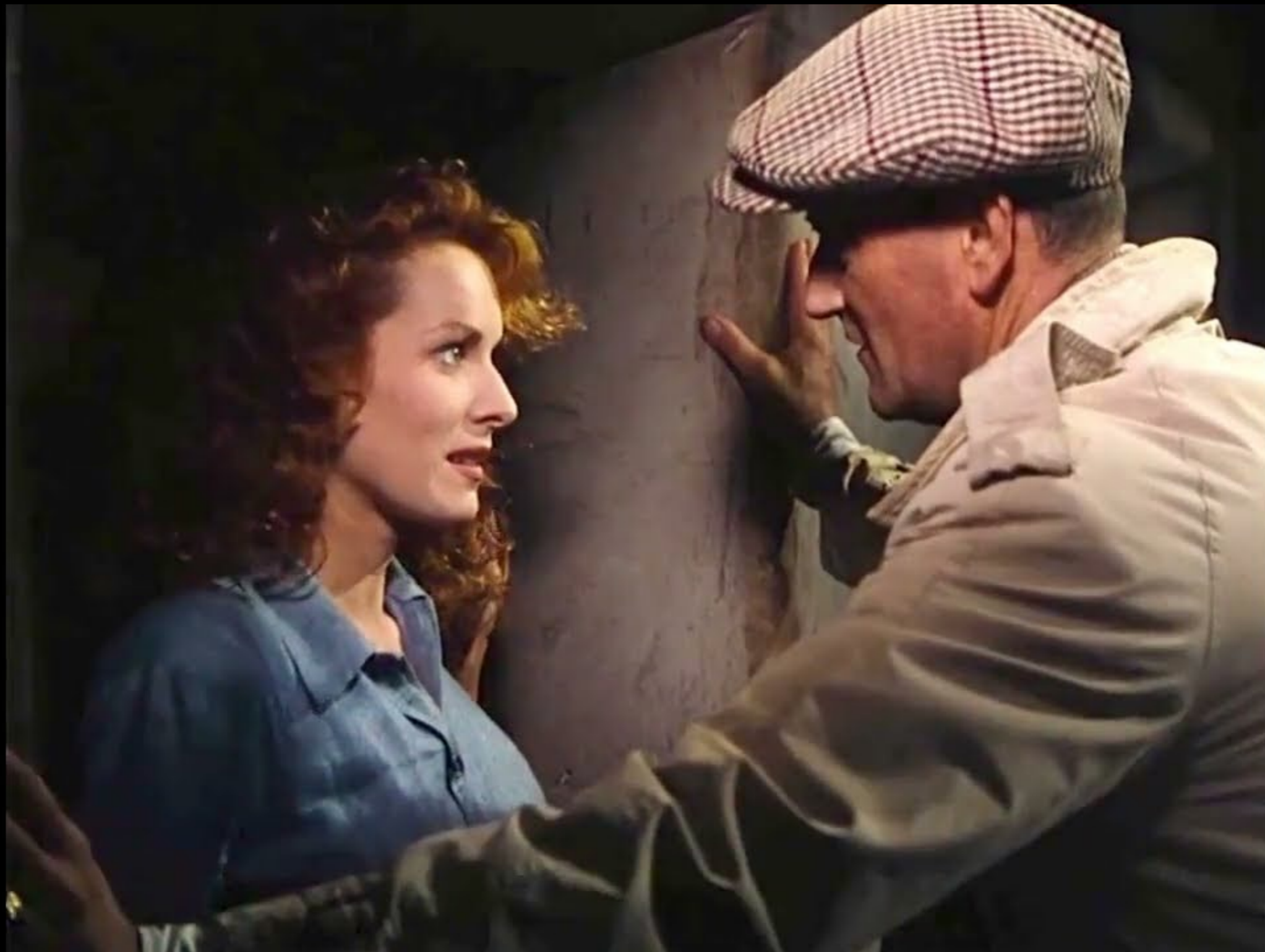
John FORD, L'Homme tranquille , 1952