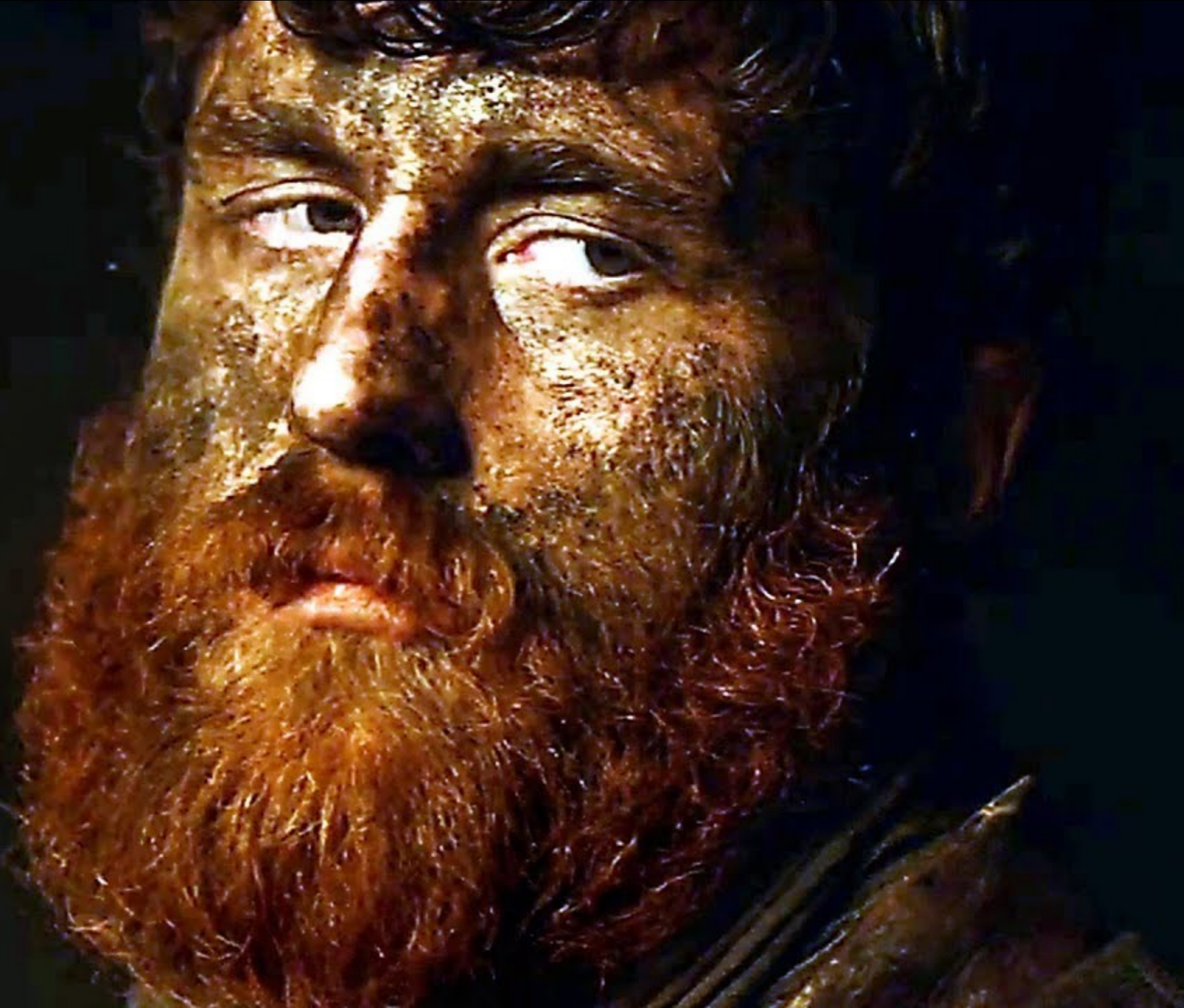
Lance DALY, The Renegade , 2018