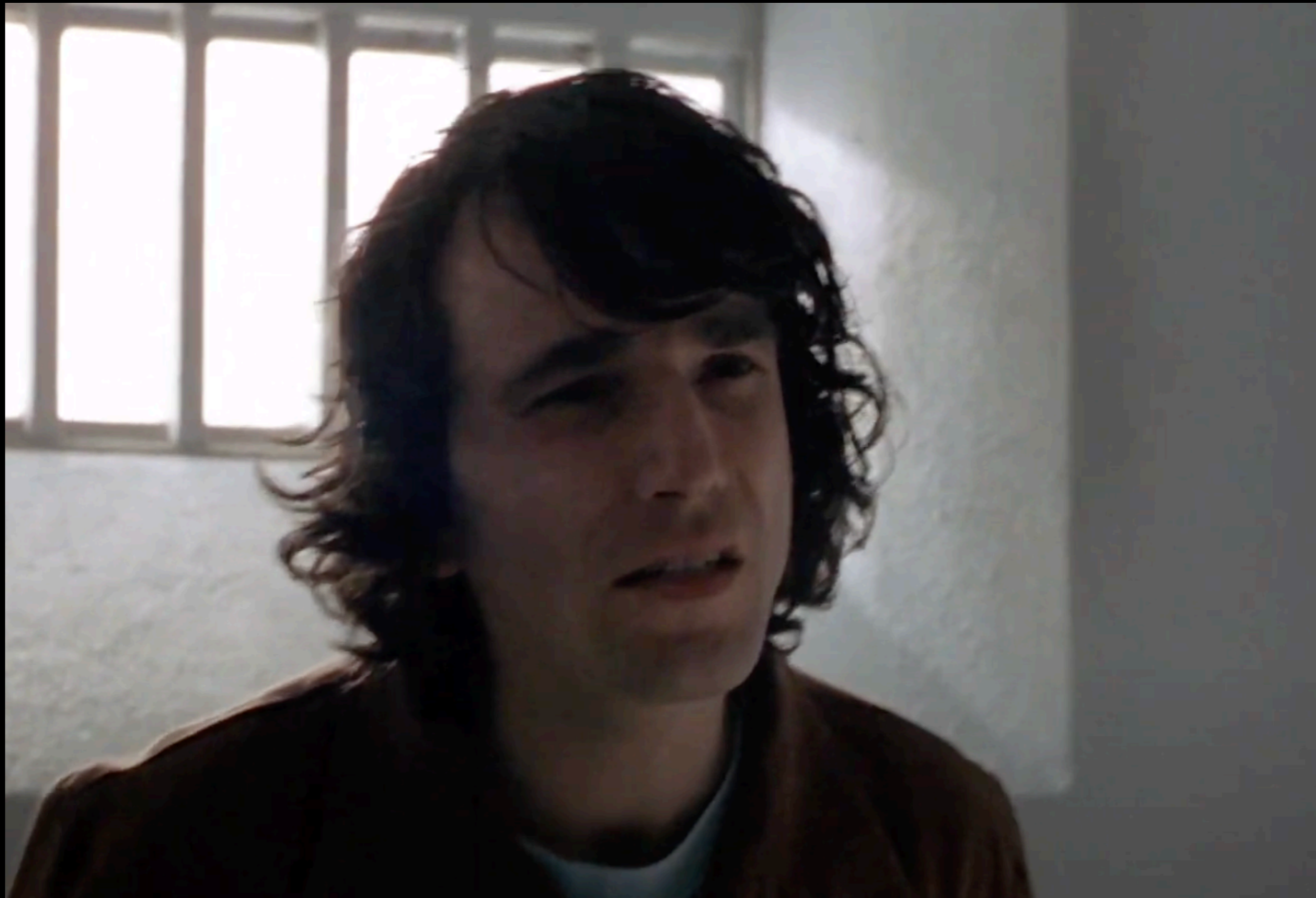
Jim SHERIDAN, Au nom du père , 1993