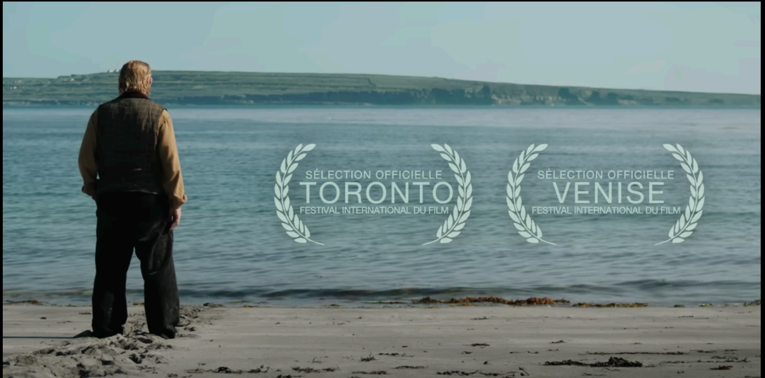
Martin McDONAGH, Les Banshees d'Inisherin , 2022