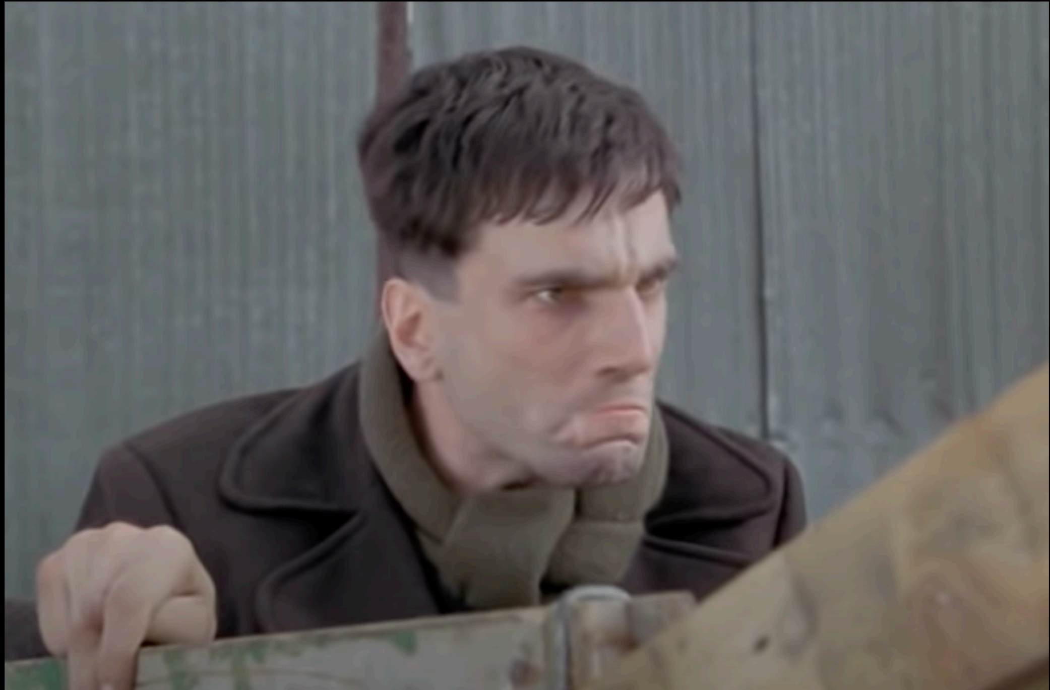
Jim SHERIDAN, My Left Foot , 1989