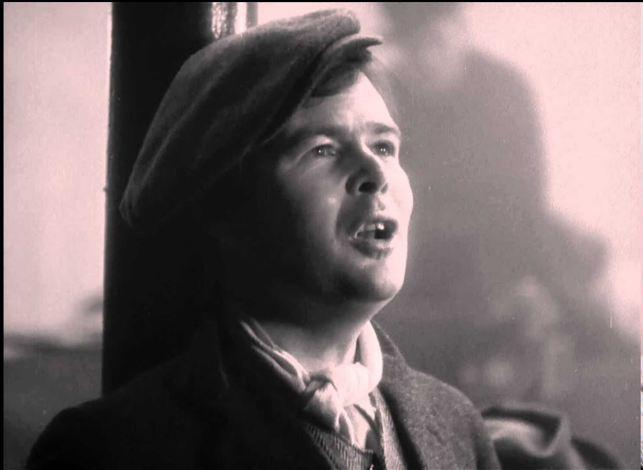
John FORD, Le Mouchard , 1935