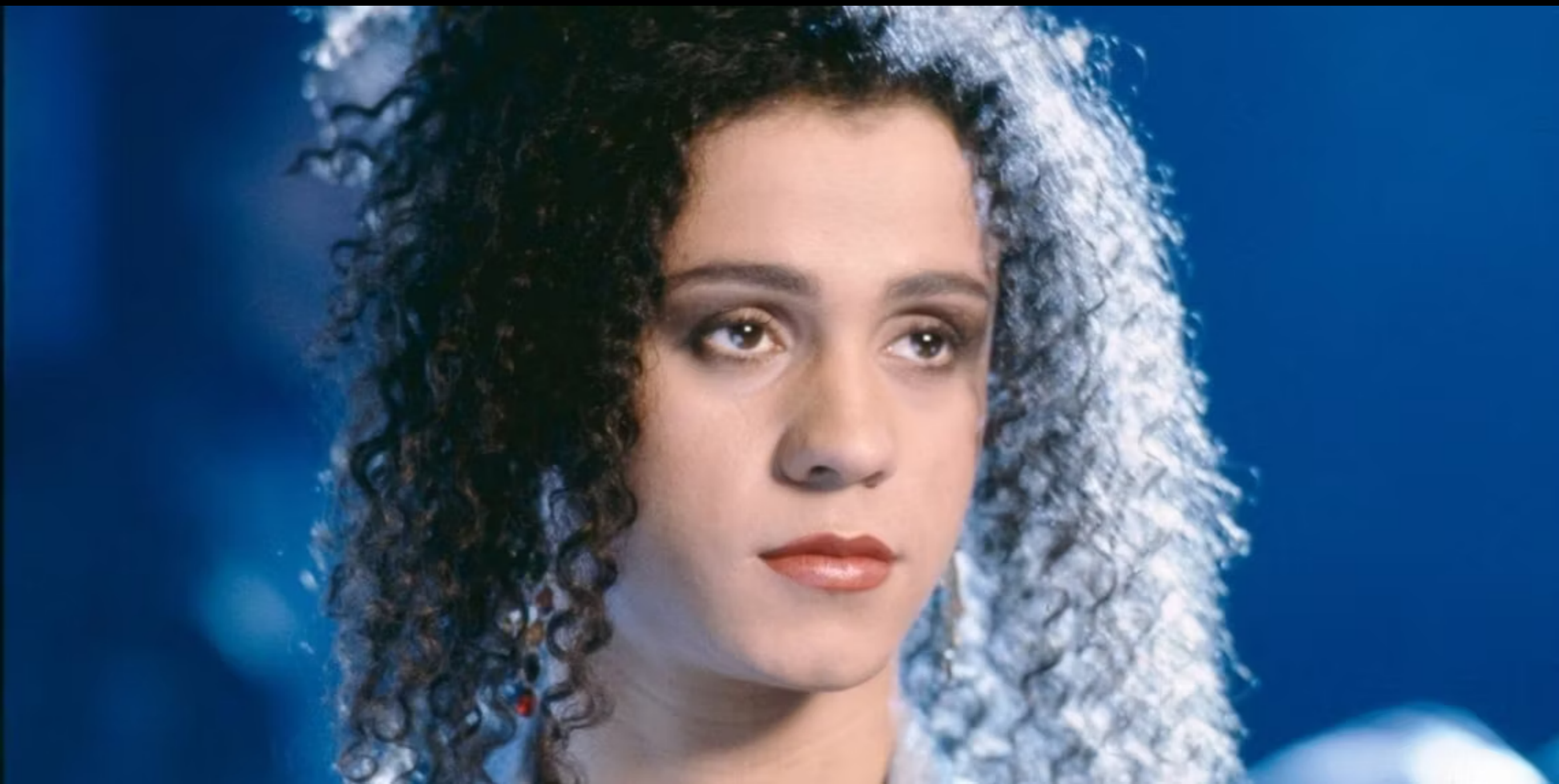
Neil JORDAN, The Crying Game 1992