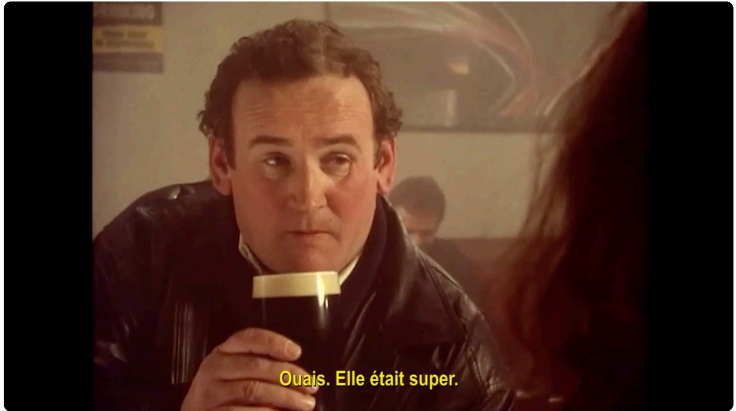
Stephen FREARS, The Snapper 1993