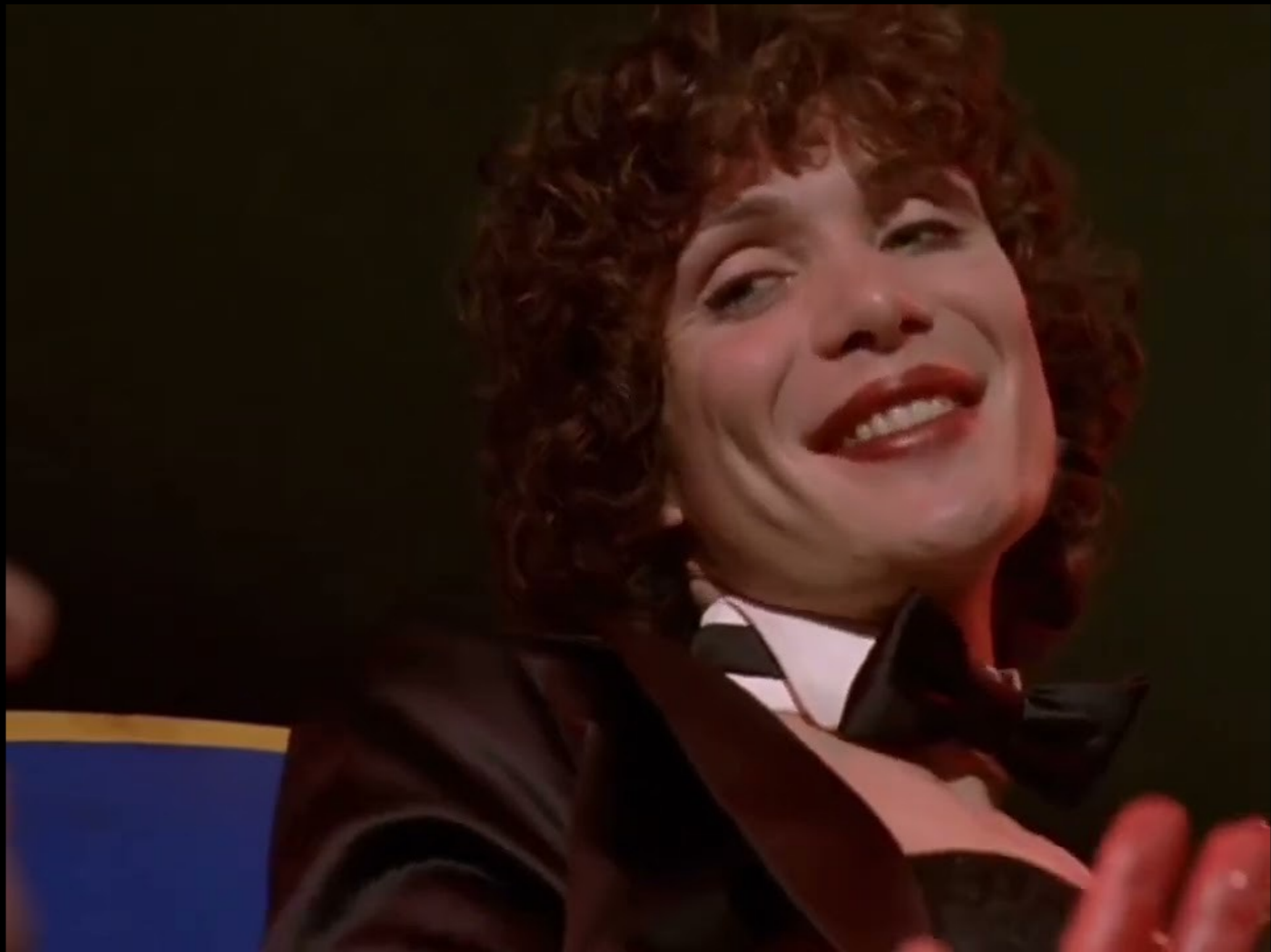
Neil JORDAN, Breakfast in Pluto , 2006 (quelques scènes)